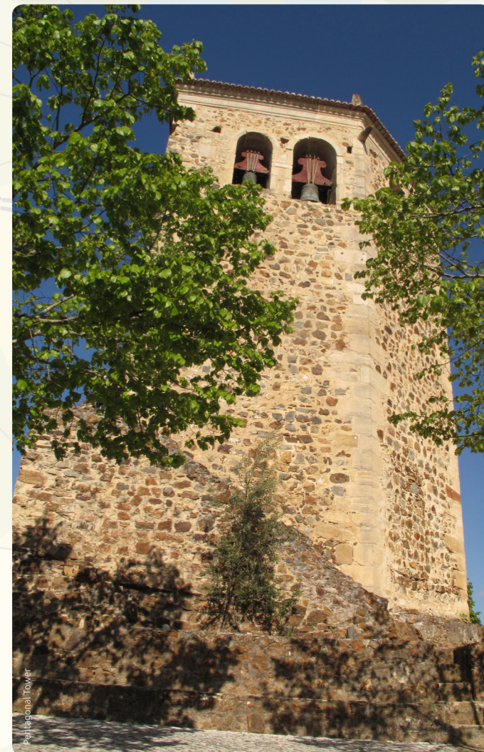
Pat. Nacional Tower